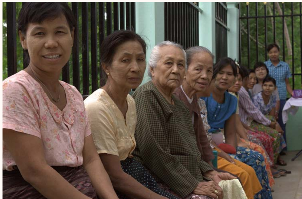
Clients waiting at an SQH clinic

SQH's target population is low income and vulnerable people in urban and peri-urban areas. Most clients live within a mile or two from the clinic and arrive by foot or bicycle. Clients coming for an IUD insertion travel longer distances than the average SQH client to reach the clinic. A recent study conducted by PSI/M's research department found that almost 60% of the IUD clients travelled at least one hour to reach the clinic, and 58% travelled more than five miles to reach the clinic.