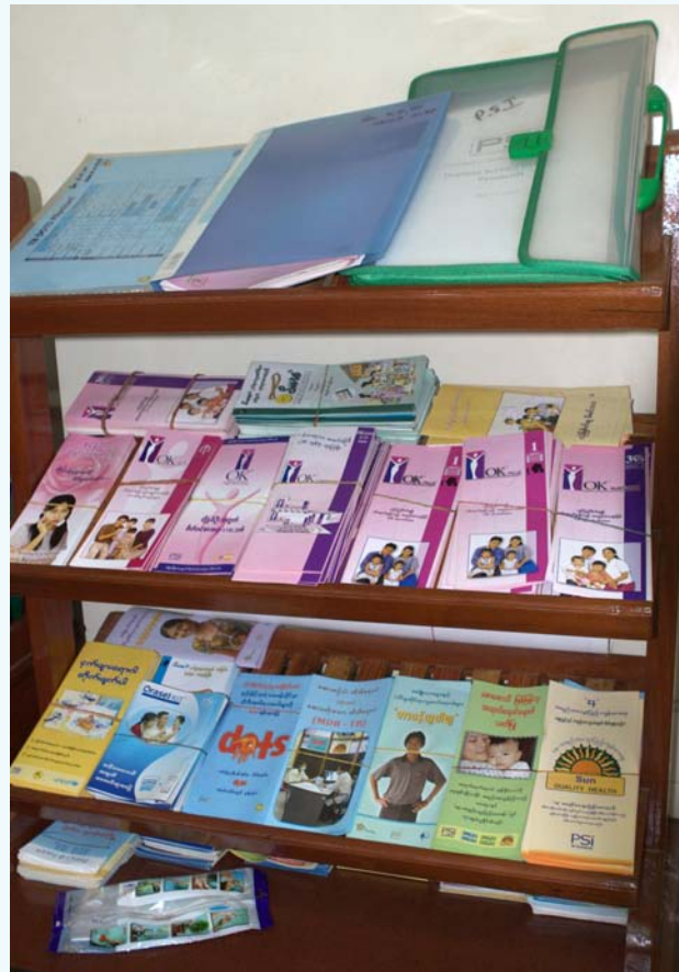
Promotional materials inside an SQH clinic

All brands are developed and tested in Myanmar to ensure that they are culturally appropriate. All products contain easily understood Myanmar instructions and other items to ensure products are used correctly, appropriately and consistently. For example, PSI/M's injectables contain low-literacy instruction leaflets, clinic return reminder cards, an injection swab, and a syringe with needle.