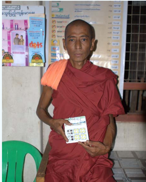
SQH patient receives Coartem malaria treatment

PSI/M has selected doctors that have demonstrated a commitment to serving the poor. Doctors agree that a benefit of being part of SQH is the opportunity to provide low-cost and high-quality drugs to the poor members of their community.