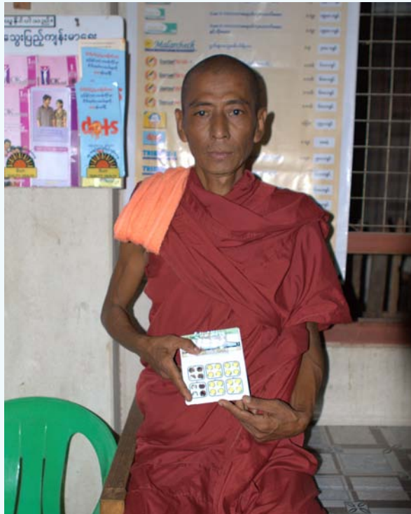
SQH patient receives Coartem malaria treatment

PSI/M has selected doctors that have demonstrated a commitment to serving the poor. Doctors agree that a benefit of being part of SQH is the opportunity to provide low-cost and high-quality drugs to the poor members of their community.