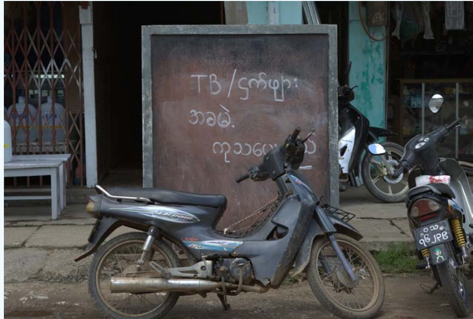
Sign advertising availability of TB treatment at SQH facility

many MOH technical strategic groups. At the township level, PSI/M staff work closely with the township medical officers in a supportive collaborative environment.