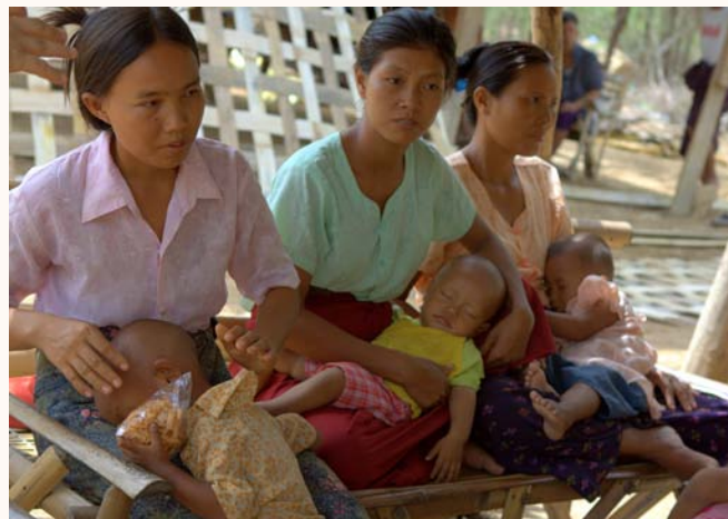
SPH clients waiting to see a provider

Some informal health education sessions have been conducted in SPH communities. However, in a deliberate attempt to maintain a low profile, PSI/M has not conducted any advertisement or demand creation activities for SPH: The need for these health services in rural communities is so great that generating client flow is not considered an issue.