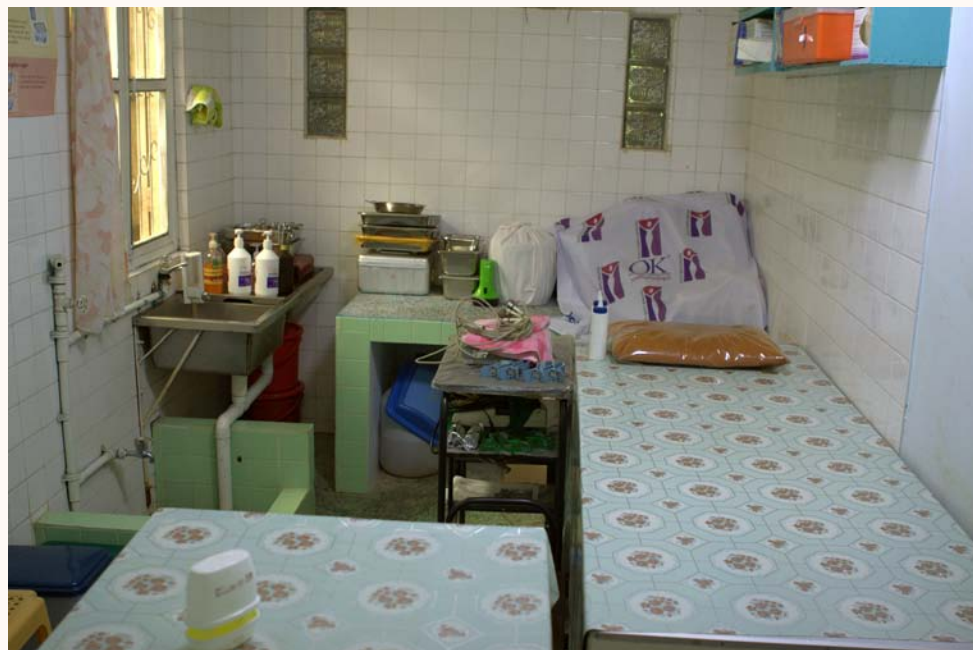
SQH examining room

SQH clinics were all pre-existing private clinics and PSI/M has not focused on standardizing the look of the clinics. Apart from having an SQH sign and the stocks of branded commodities, each clinic maintains its own appearance. PSI/M also allows the clinics to keep their own unbranded signage. All SQH clinics have a pamphlet display for PSI/M branded information, education and communication materials, wall posters, and price lists. PSI/M has provided the clinics with branded curtains that are mostly used to create private spaces.