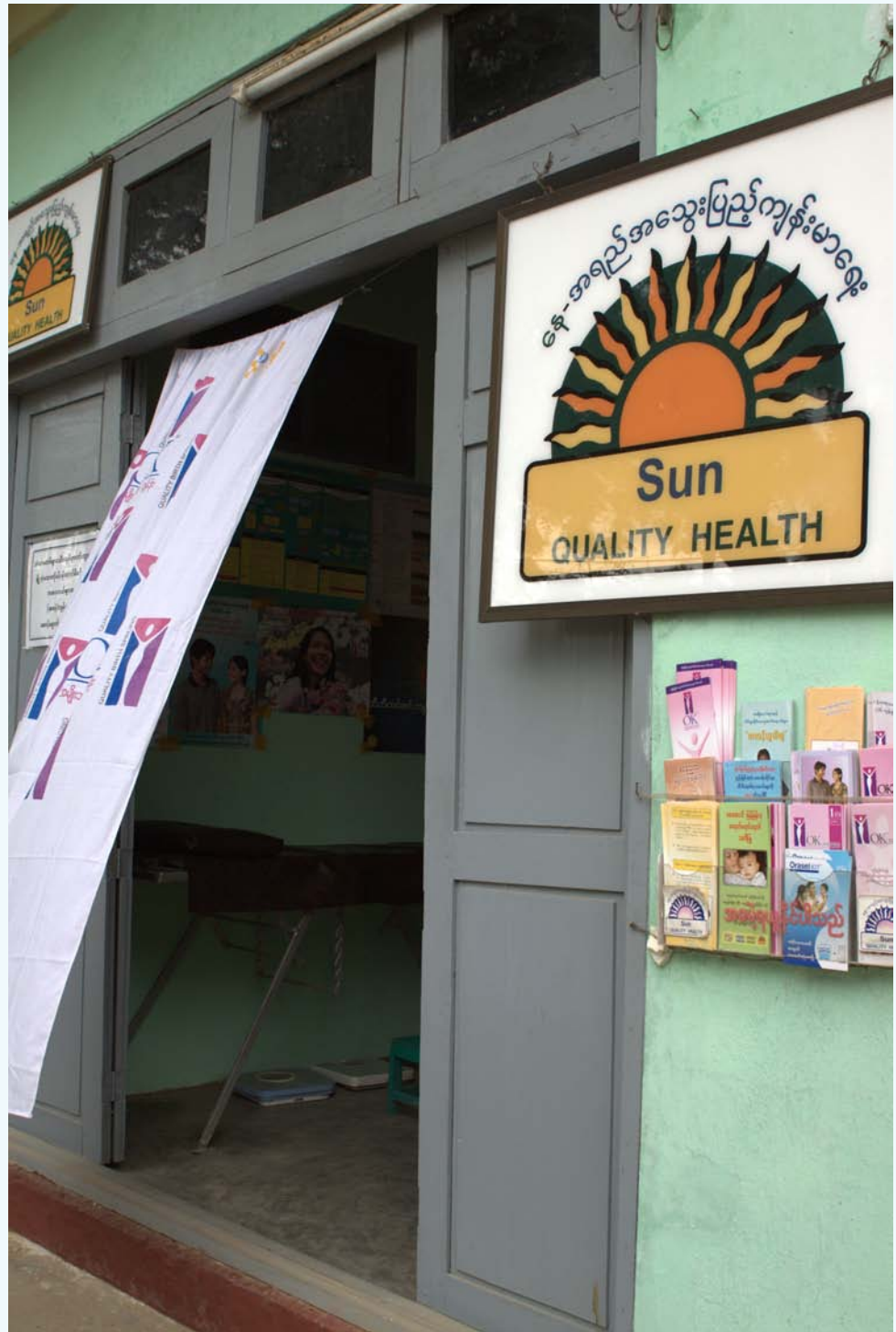
SQH clinic entrance